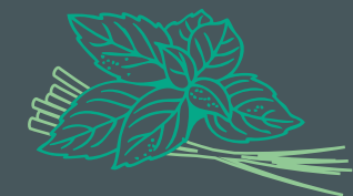
Lemon grass Peppermint

Clear, fresh aroma with invigorating, energising effect, improves concentration 200 ml